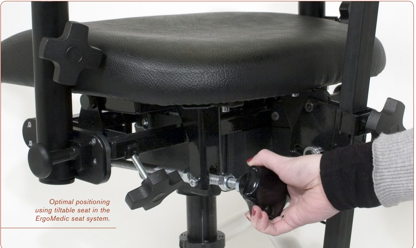
Optimal positioning using tiltable seat in the ErgoMedic seat system.

The adjustable seat angle, forwards and backwards, makes it easy to find the correct position for the patient.