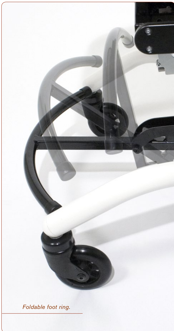
Foldable foot ring.

As accessories, we have wall mounts for the backrests that is not mounted on the chair.