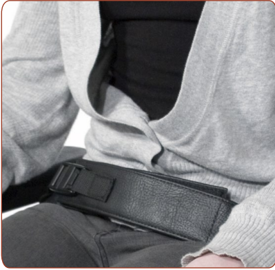
Positioning / hip belt.