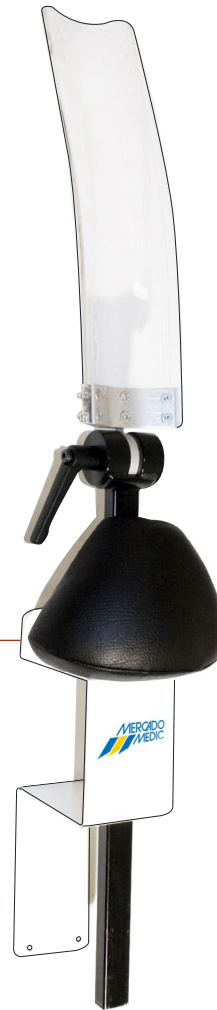
Wall mounts for backrests that is not mounted on the chair.