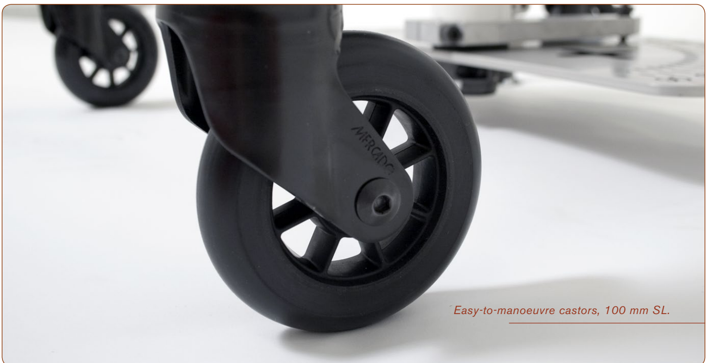
Easy-to-manoevre castors, 100 mm SL.