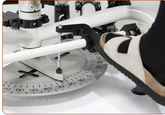
Protractor and brake are controlled by foot.