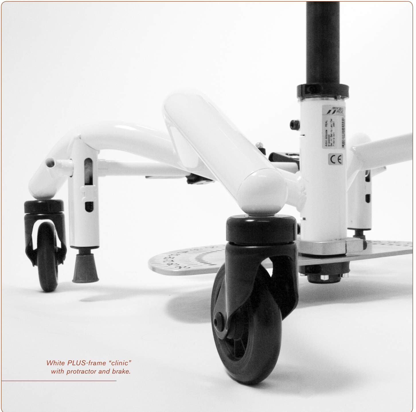
White PLUS-frame "clinic" with protractor and brake.