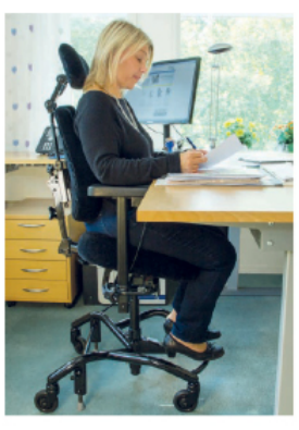
Easily adjust the seat tilt for more comfort and to relieve spinal pressure.