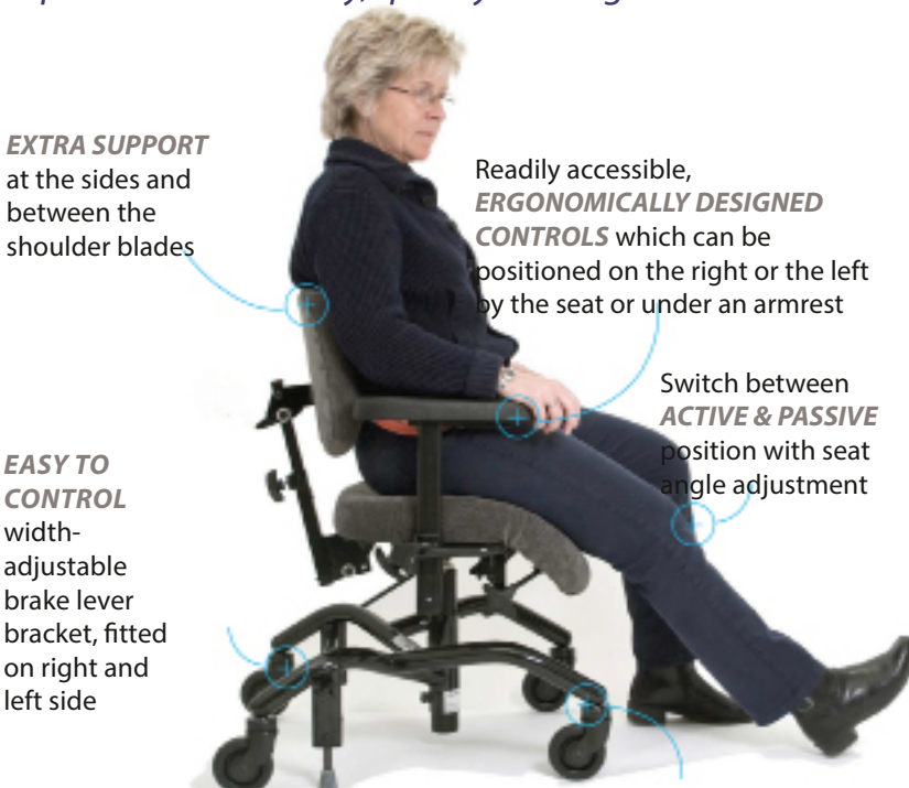
COMPACT MOBILE BASE offers plenty of space for your legs and feet

Supreme functionality, quality and ergonomics