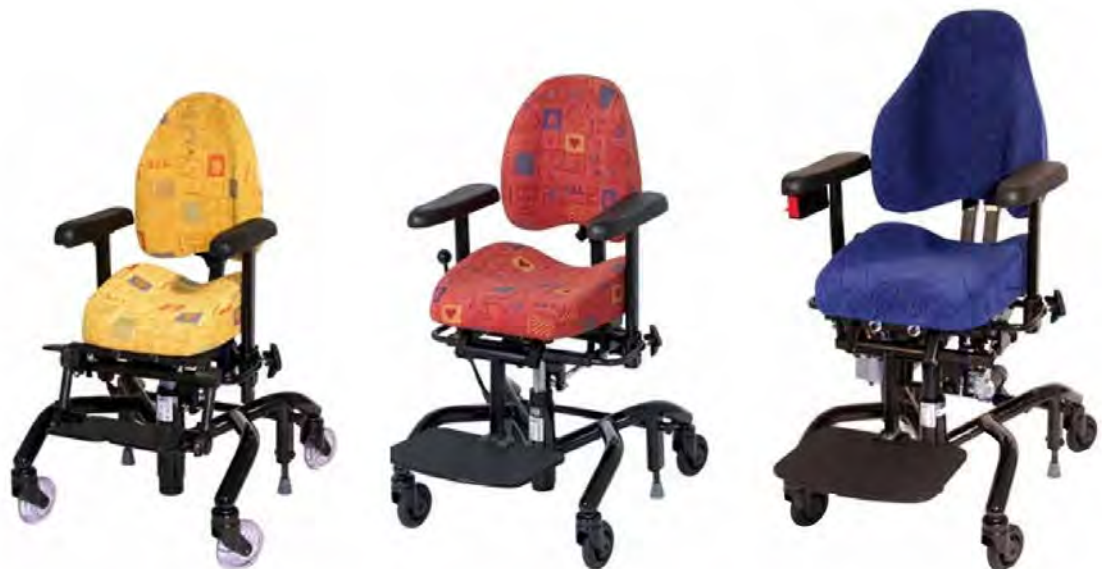
⊕ REAL® 9000 PLUS MINI

Our new reinforced mechanism for seat angle has an extended interval (+15°/-23°) and it is adjustable in three varied positions (see picture no. 7 on page 6). This option suits children with extra ordinary needs (e.g. spastic children). With a single grip you can change between the positions.